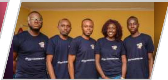
IMyque Coding Academy