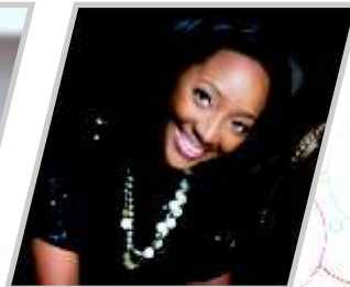
Olubunmi Aboderin-Talabi OA Foundation